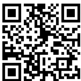
Scan code for the SIFT & PICK guide