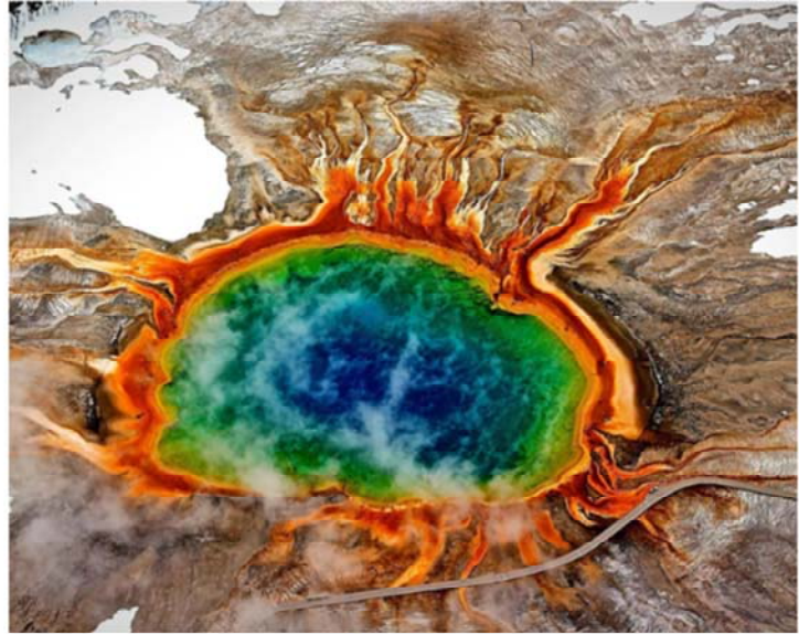
Prismatic Spring in Yellowstone National Park, a large hot spring known for its vibrant coloration. Beneath the powerful supervolcano which drives the spring and other geological activity.